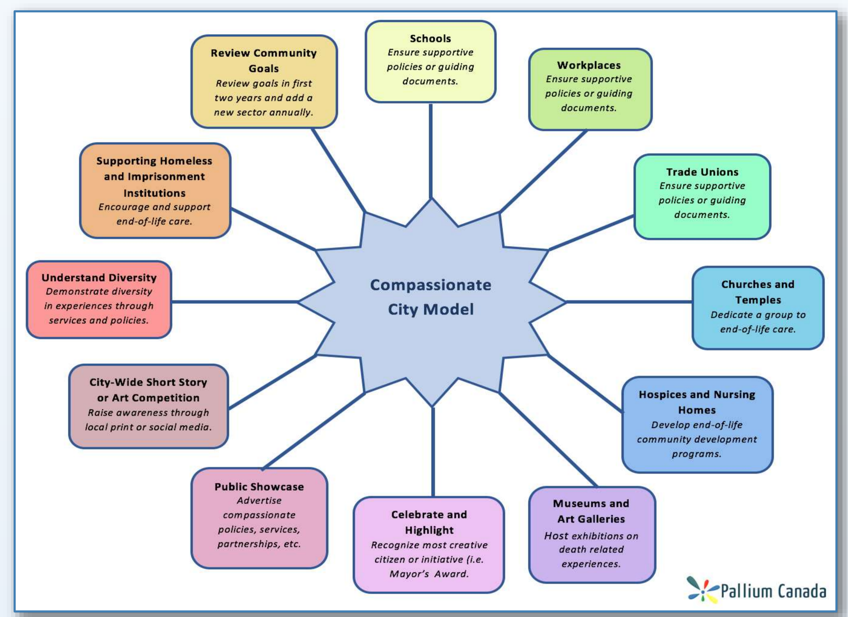
Figure 1: The Compassionate City Model of the 12 social changes framework based on the Compassionate City Charter by Allan Kellehear.